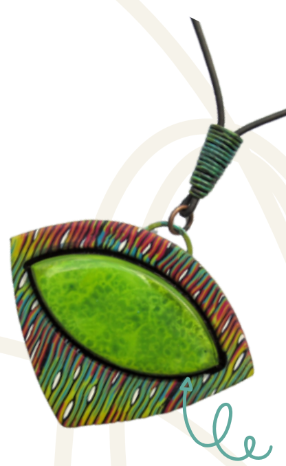
The A-I-O's create a nice channel that can be emphasized if desired.